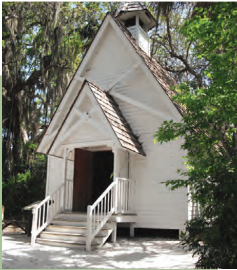
Mary's Chapel is non-denominational and provides an intimate setting for Florida-style weddings

Original stained glass windows open for ventilation and provide colorful lighting