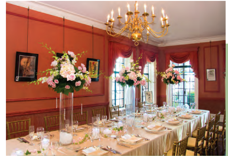
The 1931 neo-classical Burrows-Matson house on Little Sarasota Bay has an elegant interior

The Performance Pavilion is a classic stage for wedding ceremonies, luncheons, sunset cocktail parties and live entertainment