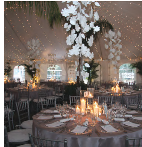
Grand lawns make ideal settings for corporate events and weddings receptions