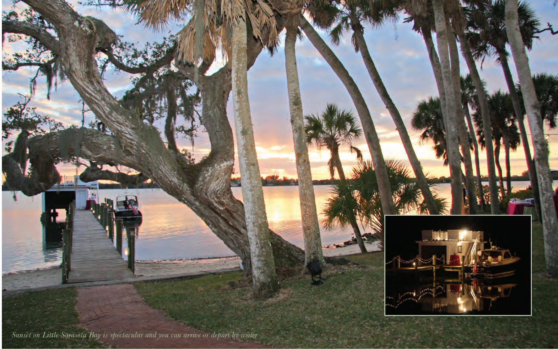
Sunset on Little Sarasota Bay is spectacular and you can arrive or depart by water

a historic destination for weddings & events