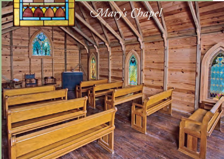
Celebrate your life together with the ringing of Mary's Chapel bell